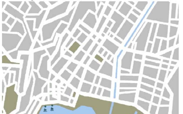
Figure 1: The setting of our study: an area of 1561 \times 997 m2 in the center of the Swiss town of Lugano.

In order to define node destinations and movements, we derived a graph representing the street structure of the town. Destinations were chosen from among all points that are located on an edge or in a vertex of the graph, and shortest paths were calculated in the graph using Dijkstra's algorithm [16]. We have chosen maximum node speeds that correspond to realistic inner city movements: from 3 m/s (10.8 km/h) to represent pedestrians or cyclists up to 15 m/s (54 km/h) to represent cars. The pause time of our RWP model is 30 s.